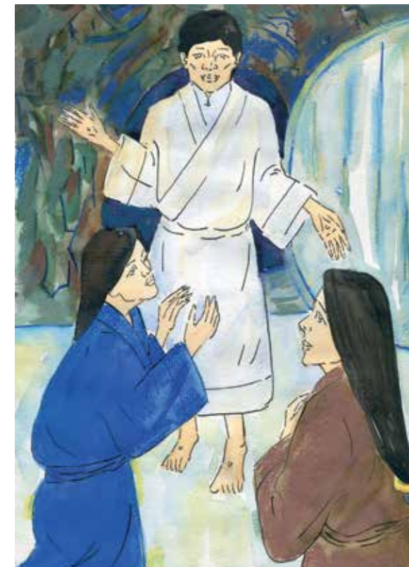
■ Women and an angel at the grave

On Sunday morning, three days after Jesus had been crucified, a woman named Mary Magdalene and some other women went to the tomb. They were very sad that Jesus was dead.