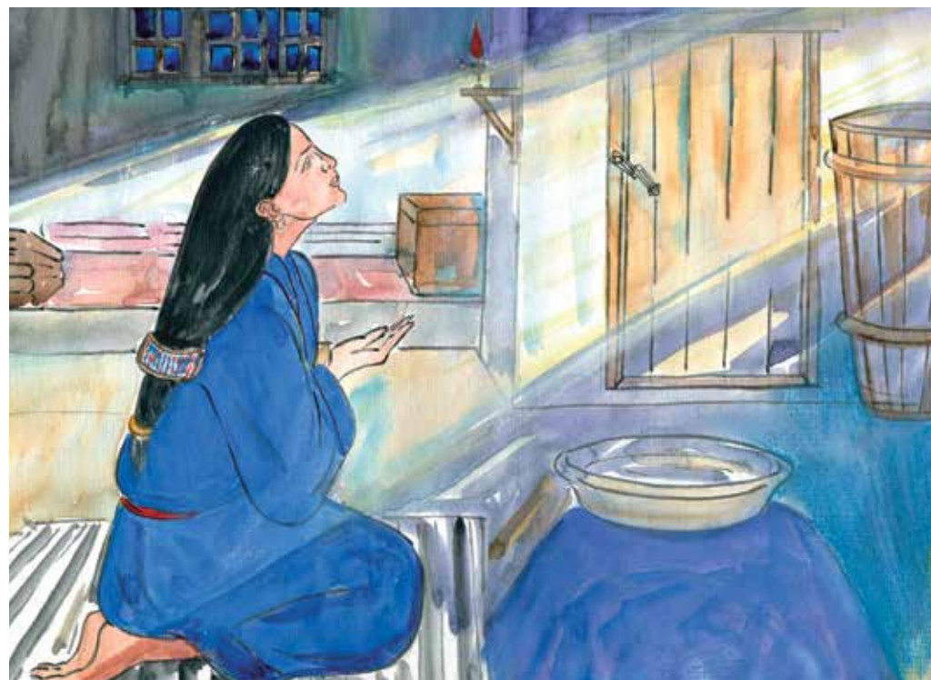
■ An angel visits Mary

Thousands of years later God had still not forgotten about the promise He had made, that satan would be defeated. His plan of salvation was soon going to unfold! And this is why this next part of the story is so important. This is the part of the story where God sends His own precious Son down from heaven to become a human being. This took place about 2000 years ago in the country called Israel. This is the Christmas story: