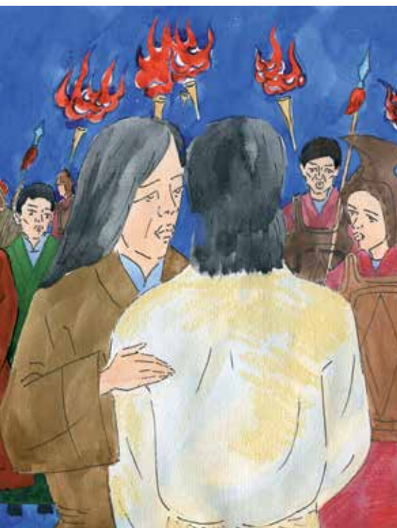
■ Jesus caught in the garden

Jesus was sad. He told his friends, "Stay awake and pray for strength." Then Jesus knelt to pray. An angel from heaven came to comfort Him.