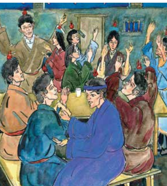
■ Tongues of fire on the heads of the followers

Jesus walked among His friends in Israel for 40 days after He had risen from the dead. Then He led His disciples to a mountain outside the city. He said, "In a few days, you will be filled with the Holy Spirit. Don't leave Jerusalem (the capital city of Israel) until you receive this promise." The "Holy Spirit" Jesus was speaking about, was the Spirit from God. He is also called "Helper" and "Encourager". Jesus continued, "The Holy Spirit will give you power to be my witnesses in all the world." Jesus blessed them. The disciples worshiped Jesus, then He went up into heaven.