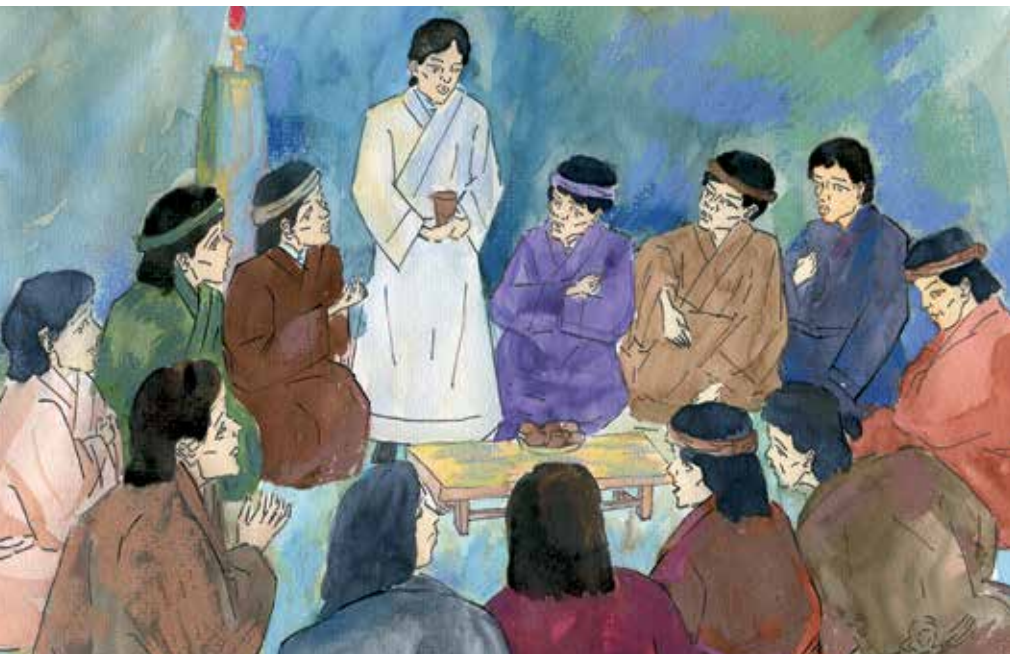
■ Jesus with His closest friends

There was a special reason that God gave his son to live on earth. He had promised that He would kill the snake, remember? This is the next part of the story: