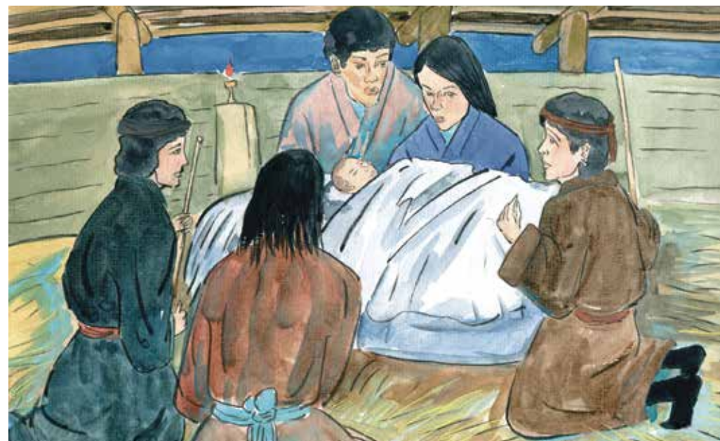
■ Shepherds visit the manger

The emperor in Israel at that time said that all people must go to their birth places to list their names and to pay taxes. Joseph and Mary travelled many miles to Bethlehem, their hometown. Mary was tired since she was pregnant, but there was no place to rest. Bethlehem was very crowded and Mary and Joseph had to spend the night in a stable. During the night, Mary gave birth to the baby. She really cared for her special child. She wrapped Him in warm clothes and made a cosy bed for Him in a feeding trough.