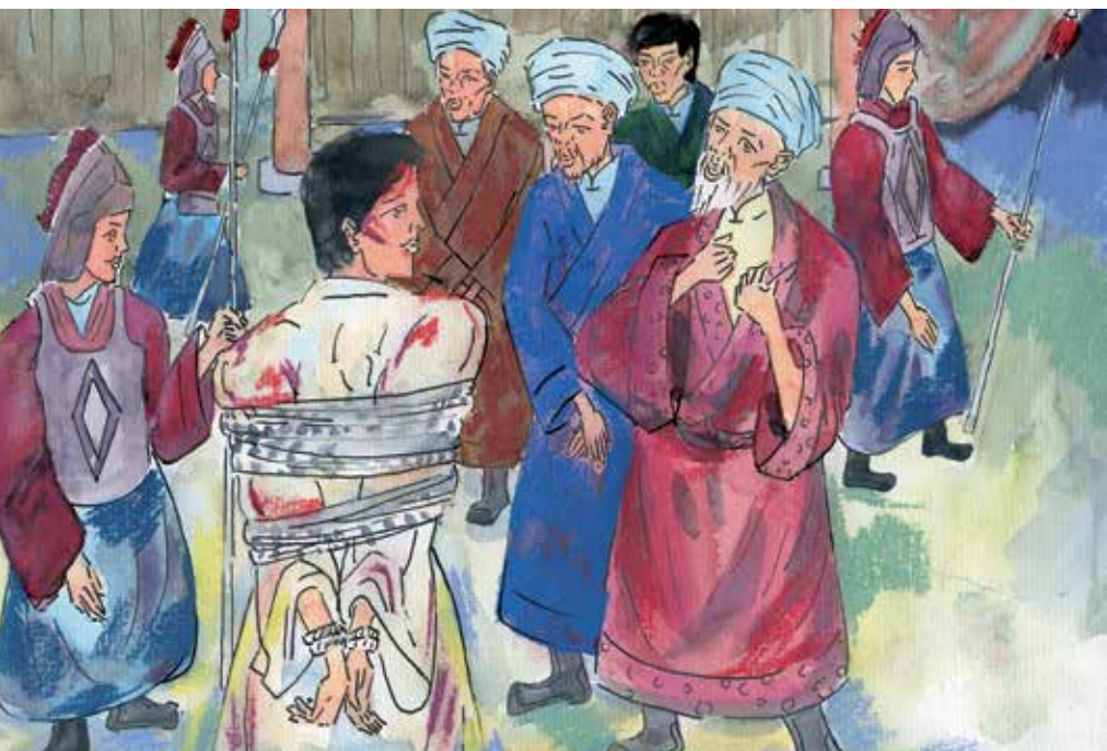
■ Jesus caught, soldiers and priests around him

All Jesus' friends were afraid and ran away. The soldiers took Jesus to the house of one of the religious leaders. Peter followed far behind them. In the courtyard, a servant girl asked Peter, "Are you a follower of Jesus?" Peter said, "No!"