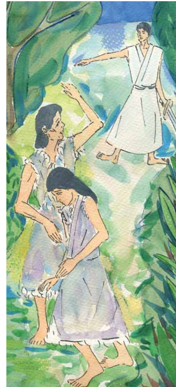
■ Adam and Eve leaving garden

God told Adam and Eve, "Because you chose to not obey me, you must leave the garden