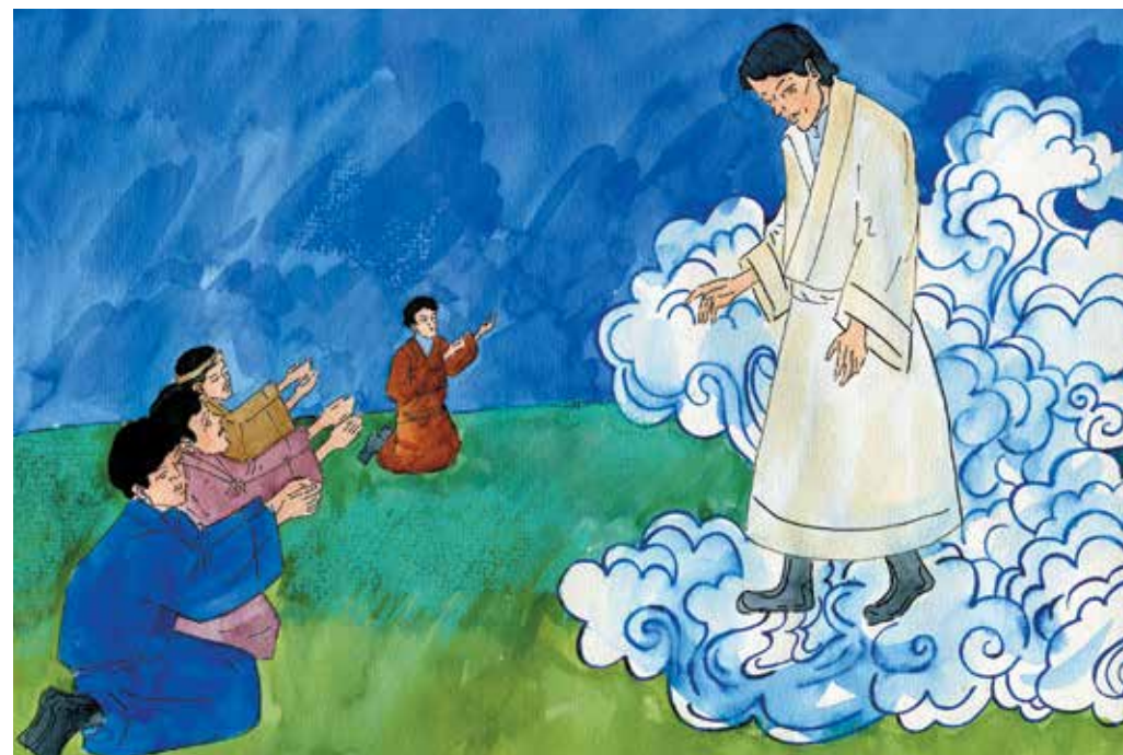
■ Jesus ascending to heaven

So the sin had to be washed away with a sacrifice. The sacrifice was Jesus, the Son of God, who was without sin. He died on the