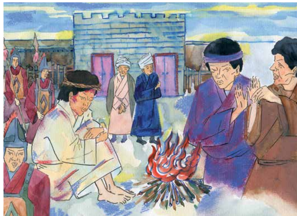
■ Peter just denied Jesus

"I won't!" said Peter, who was one of his close friends. Jesus said, "Before morning, you will say three times that you don't